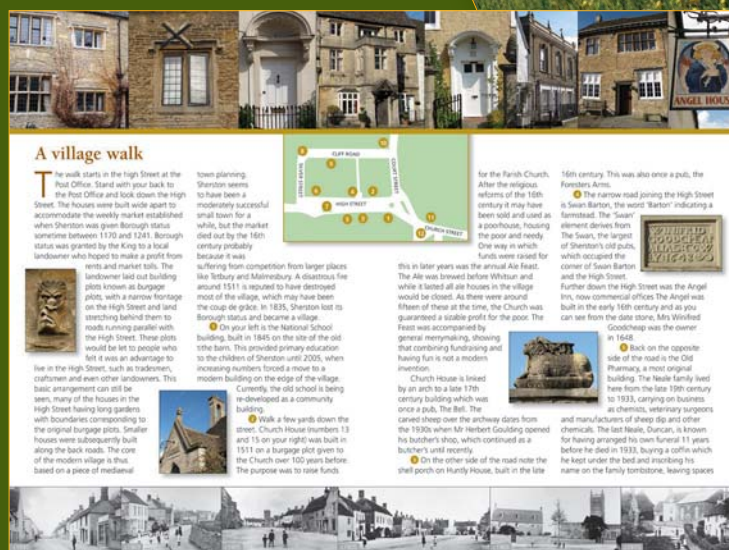
A page from the guide

Copies can be bought from the Rattlebone Inn, Tuck's and Sherston Post Office Stores. For more information contact: Sherston Parish Council T: 01666 840351 E: clerk@sherston.org.uk