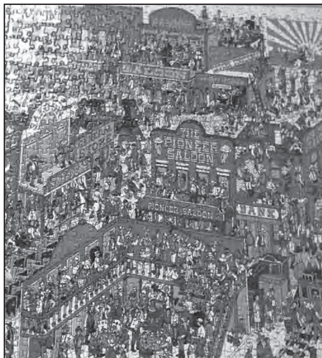
Some of the wonderful completed puzzles arriving daily