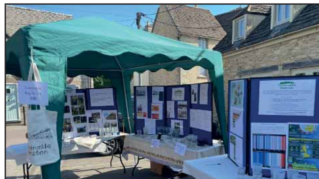
Sustainable Sherston stall at the Boules Tournament