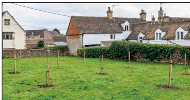
The Community Orchard in March 2021