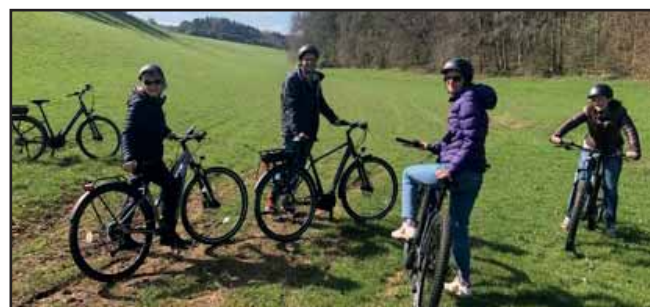
Getting to grips with electric bikes from the Wild Carrot at Chavenage.