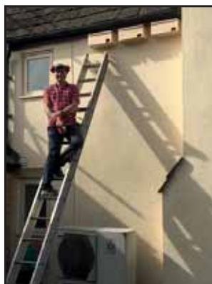
Installing the swift boxes

of which went to the Friends of Sherston School (FSS) and towards our future projects. Note: Final bottles will be on sale on Saturday 11 February, 2.00-4.30pm, Sherston Village Hall.