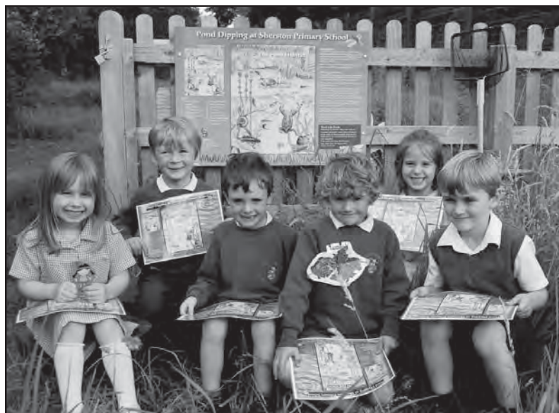
Children of Oak Class at Sherston Primary School learn about wildlife at the school pond