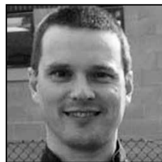
Police Community Support Officer