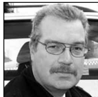
Community Beat Manager

We are your dedicated neighbourhood policing team working with you and our partners to tackle your local concerns.