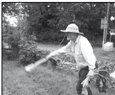
The modern form of mangold hurl dress and technique.