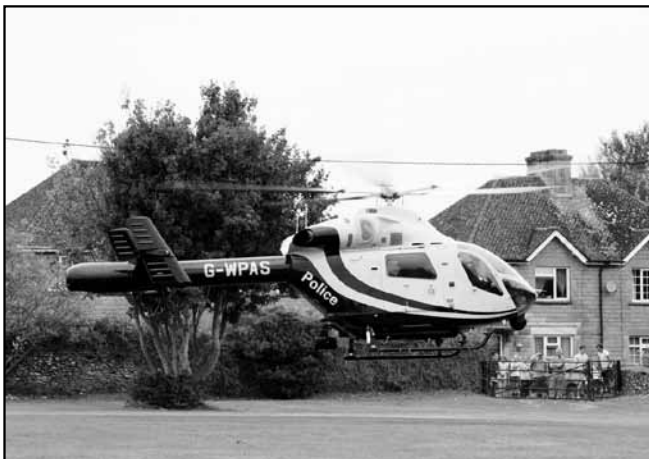
Air Ambulance at the Rec last month.

The Wiltshire Air Ambulance Appeal acknowledge with grateful thanks the donation of £1,000 from Sean Richards & friends as a result of their recent event held at Lordswood Farm, Sherston.