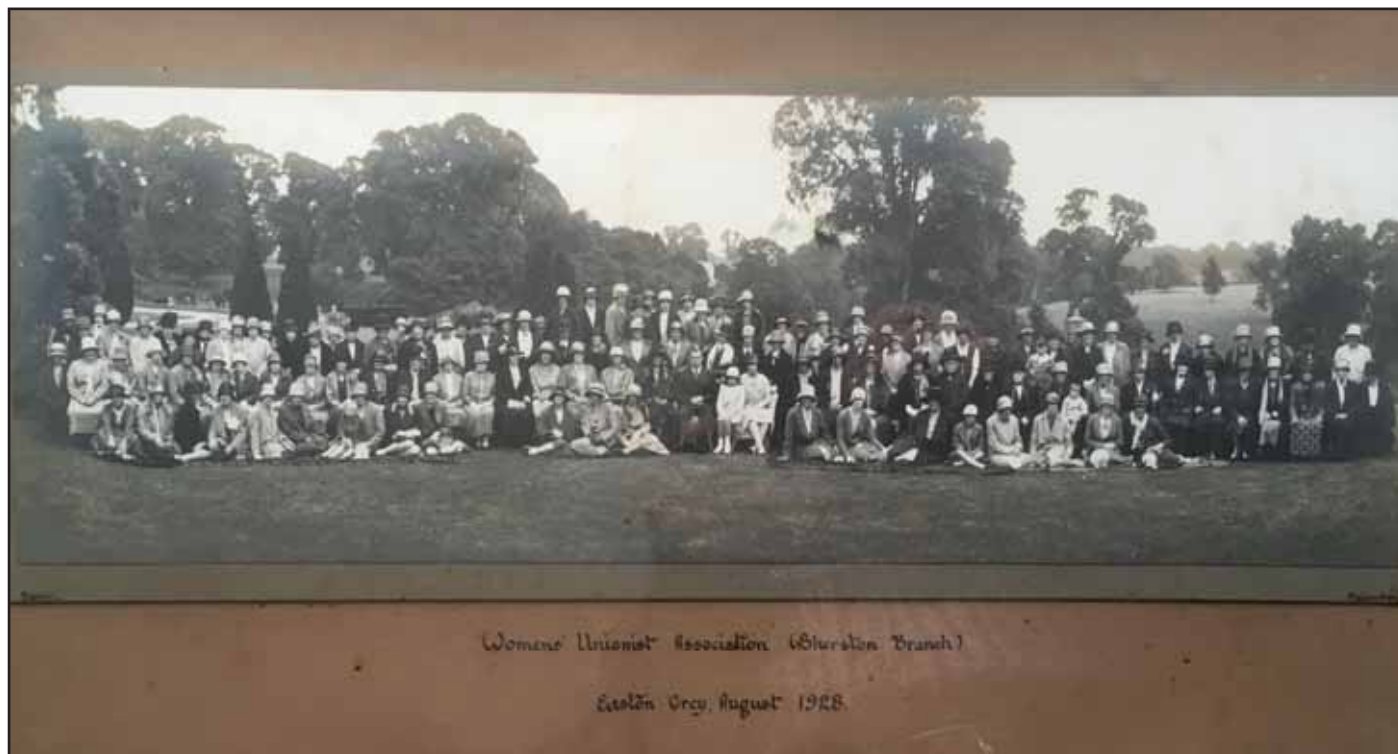
Victor Cazalet MP and the North West Wiltshire Women's Conservative and Unionist Association, Sherston Branch, August 1928