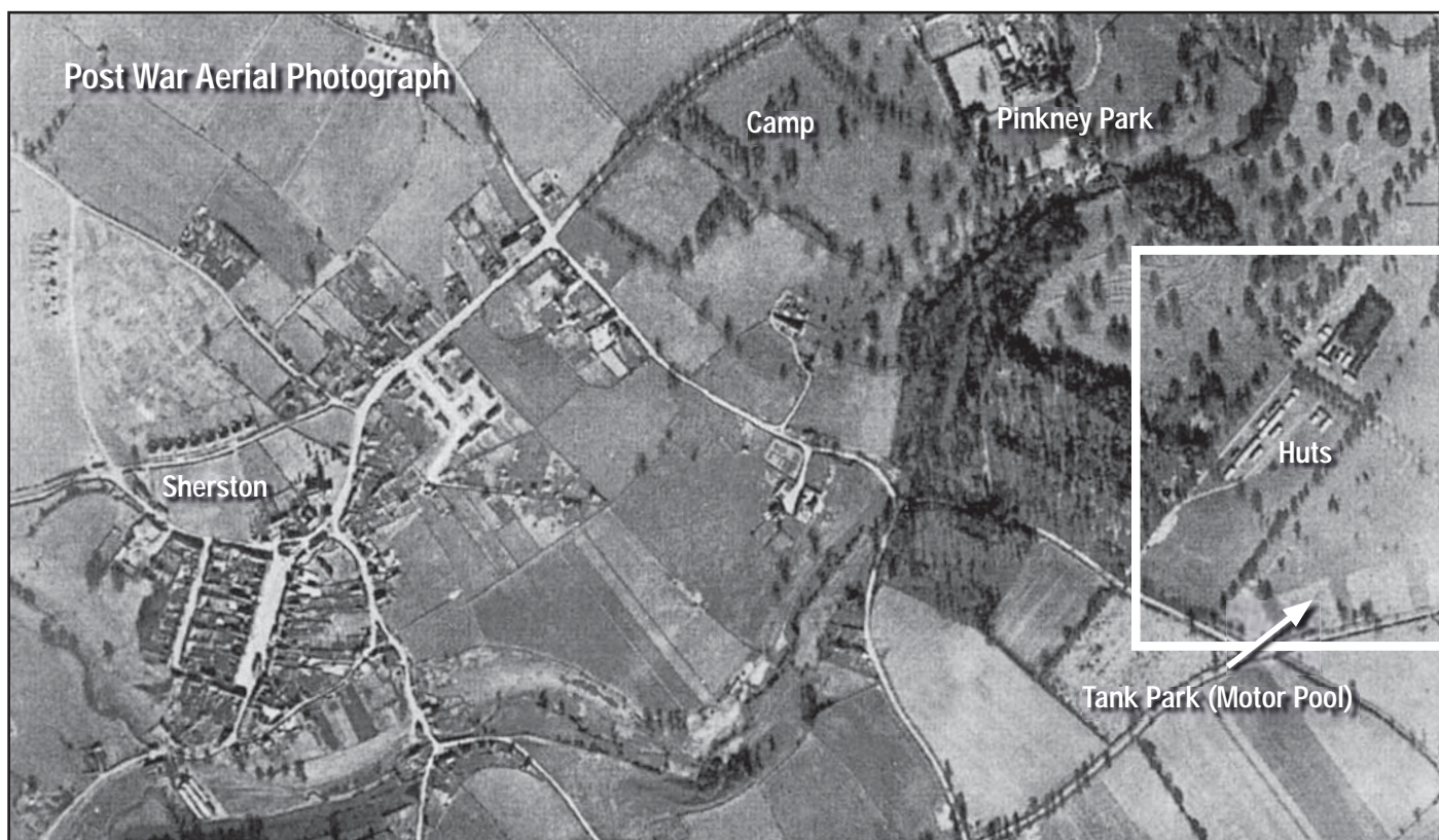
Where the 626th were based in Sherston