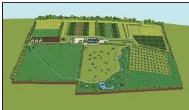
FarmED is a demonstration farm in Shipton-under-Wychwood.