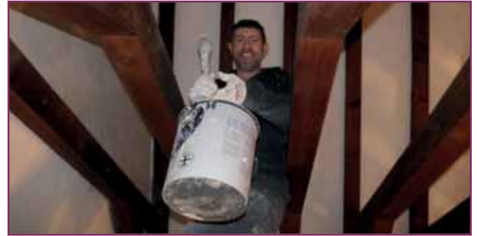
Painting by Silkwood Decorating