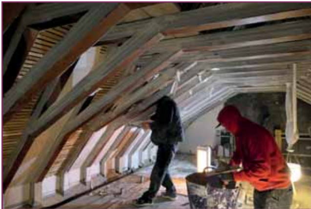
New oak battens and new plaster by Wheatley Plasterwork Limited

Our next challenge is to relay the damaged floor in the north aisle, and to carry out much-needed repairs to the mullions in the windows, plus other maintenance to keep our Grade 1 listed building in good order.