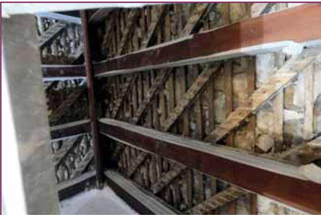
After removal of the damaged ceiling