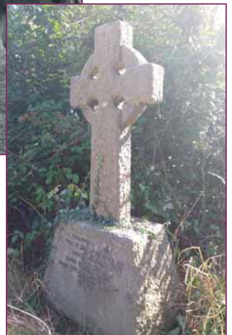
Photo of grave taken 10/8/24