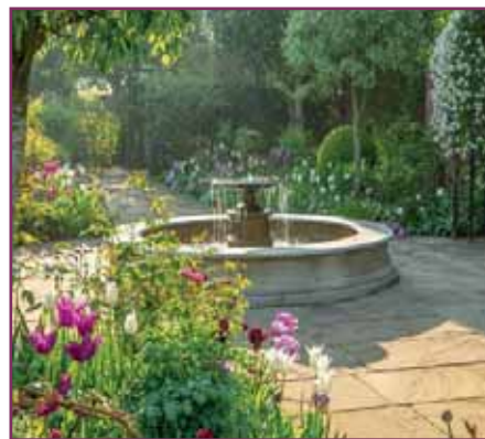
A corner of the stunning gardens at Morton Hall near Redditch, Worcs.

Our first jolly 2025 coach trip will be on 8 May. Morton Hall's stunning tulip displays have received widespread media attention, including a feature on BBC Gardener's World in 2024. Now in its sixth year, there are over 100 varieties to drool over in pots, raised beds and borders. There may still be a few seats left on the coach so it's worth asking at the meeting or contacting our Secretary direct.