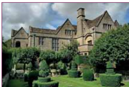
Topiary splendour at Rodmarton Manor, one of many garden 'rooms'