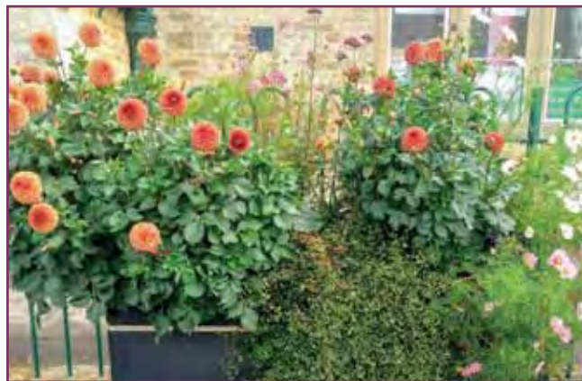
Dahlia divas: autumnal tints in the post office trough

When this lot above have finished flowering, we'll remove them, keep them dry in the hope they'll last another season and replace them with narcissi and tulip bulbs for another colourful spring display. We also hope to dot more daffodils around village verges for some welcoming pops of colour.